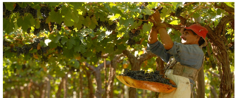
Pergola-Trained Old-Vine Criolla Grapes in Argentina

The Clarete de Criola is a seriously cool wine—a bright, dry, crushable rose. It’s crafted from a field blend of old-vine Criolla grapes— Criolla Grande, Cereza, Moscatel, Torrontés Riojano, and Pedro Jimenez —grown at 850 meters in a high desert and trained on pergolas to shield the fruit from the sun. These grapes are the ancient heartbeat of South American wine, spontaneous crosses of Moscatel de Alejandría and Listán Prieto that defined winemaking on the continent for centuries